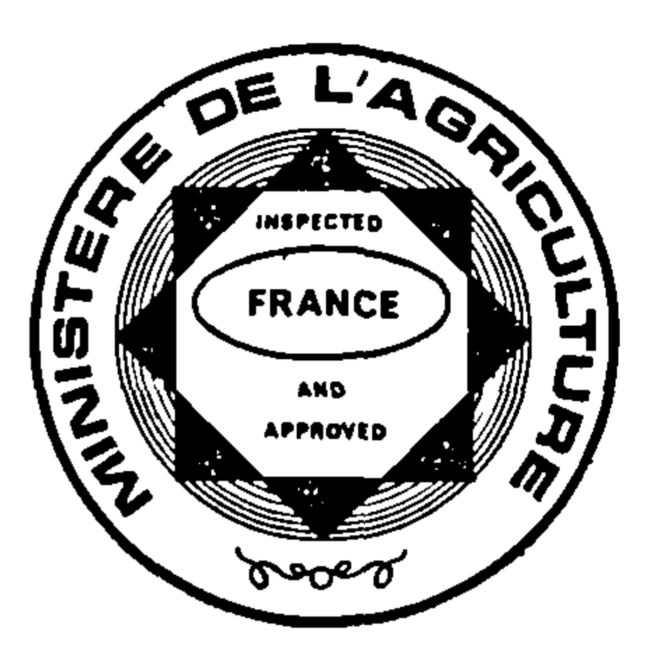
SERVICE VETERINAIRE Nom, qualité et domicile du signataire

In relation to meat products (including canned meat, edible fats and casings) a label in the form set out below: