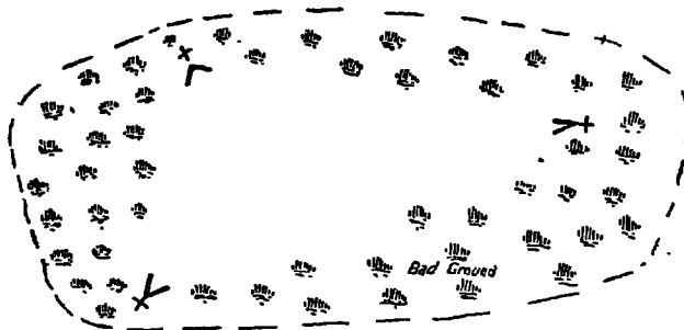
FIG. 3.—UNFENCED GROUND. (Showing unfenced aerodrome surrounded by bad ground.)