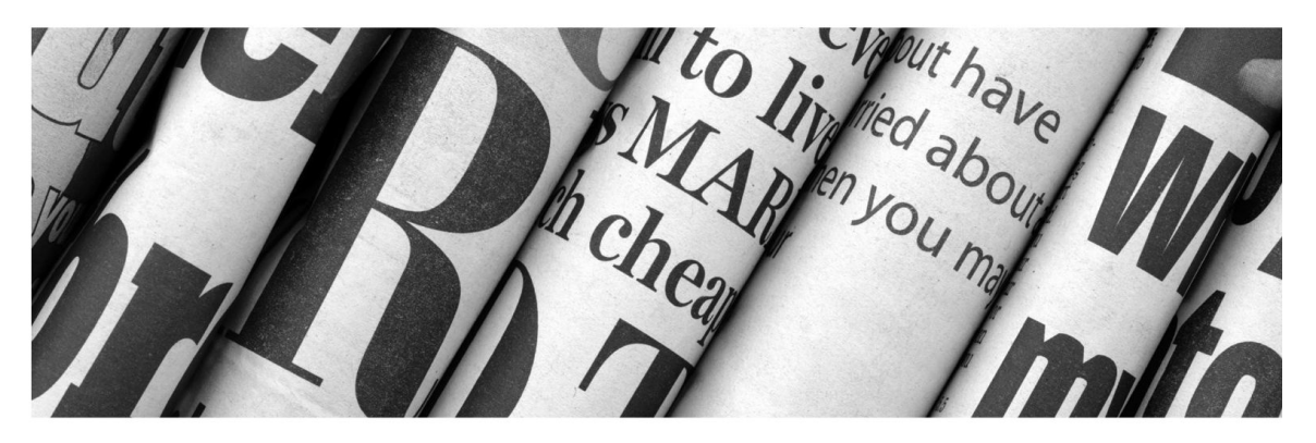
To place a notice visit www.thegazette.co.uk/wills-and-probate/place-a-deceased-estates-notice